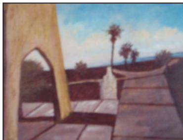
La Pinta Afternoon