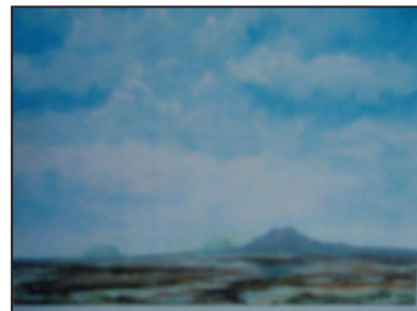
Fog Lifting from False Bay