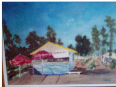
Fish Tacos... Yum!